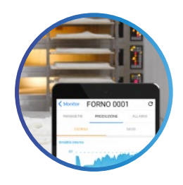
Machines and sensors integration